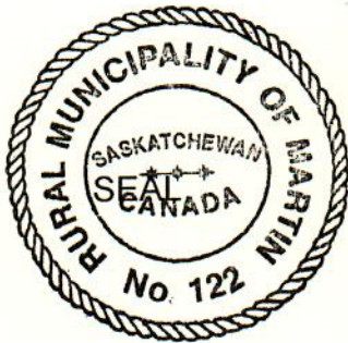
Gerald Flaman - Reeve